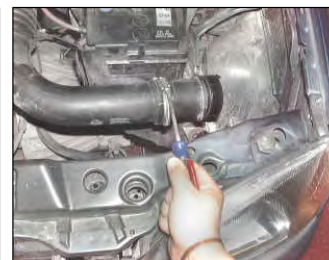
Fig. # 10