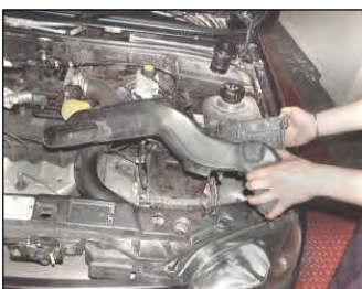
Fig. # 4