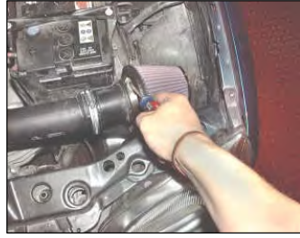
Fig. # 13