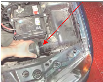
Fig. # 1

For cleaning instructions please visit our website: www.knfilters.com/cleaning