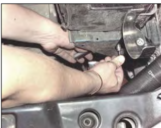
Fig. # 8