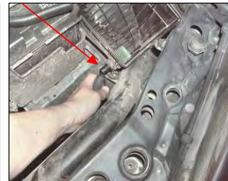
Fig. # 3