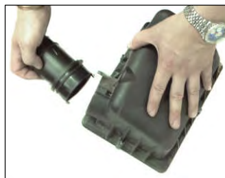
Fig. # 9