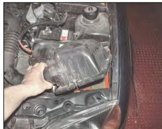
Fig. # 2