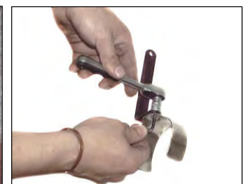
Fig. # 7