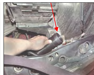
Fig. # 6