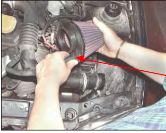
Fig. # 12