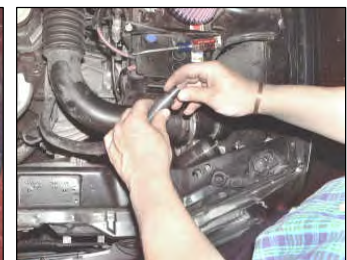
Fig. # 11

For technical support contact our European technical team: "eindhoven.tech@knfilters.com" We will try to answer your mail within 48 hours.