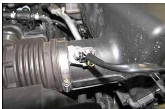
3. Disconnect the mass air sensor electrical connection and unhook the wiring harness from the air filter housing.