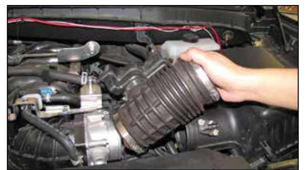
5. Loosen the two hose clamps that secure the factory intake tube and then remove the tube from the vehicle.