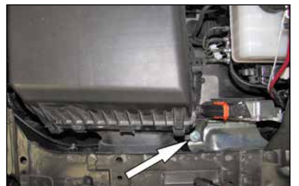
6. Remove the bolt shown that secures air filter housing to the inner fender and then lift the air filter housing up to dislodge it from the mounting grommets and remove it from the vehicle. NOTE: K&N Engineering, Inc., recommends that customers do not discard factory air intake.