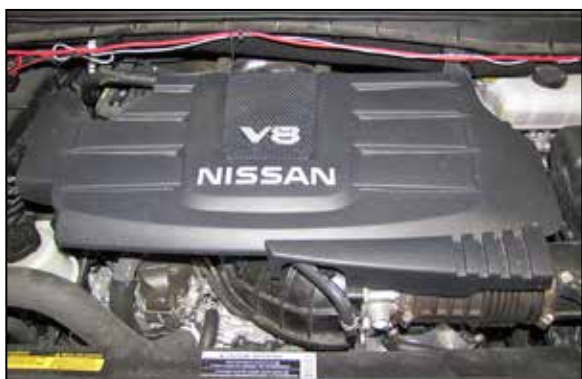
2. Lift off the decorative engine cover.

1. Turn off the ignition and disconnect the negative battery cable. NOTE: Disconnecting the negative battery cable erases pre-programmed electronic memories. Write down all memory settings before disconnecting the negative battery cable. Some radios will require an anti-theft code to be entered after the battery is reconnected. The anti-theft code is typically supplied with your owner's manual. In the event your vehicles anti-theft code cannot be recovered, contact an authorized dealership to obtain your vehicles anti-theft code.