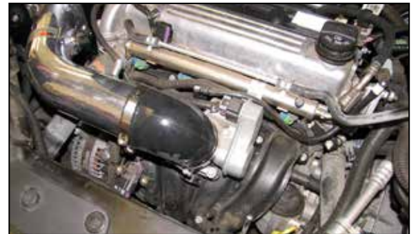
24. Install the intake tube assembly, attaching the silicone hose onto the throttle body as shown.