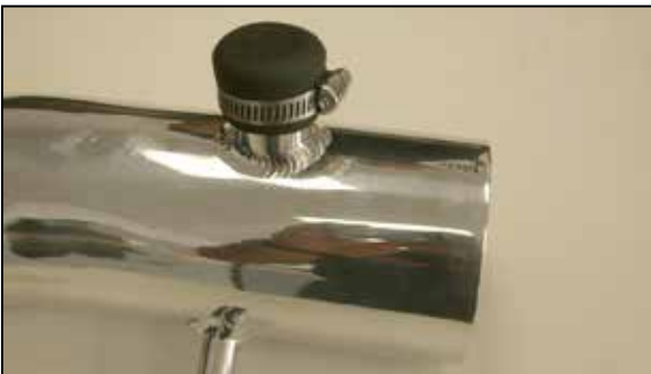
13. On models NOT equipped with air injection, install the provided cap onto the 1" vent fitting and secure with the provided hose clamp. NOTE: You may now proceed to step #17.