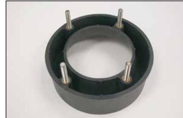
18. With the provided hardware, assemble the studs onto adapter as shown.