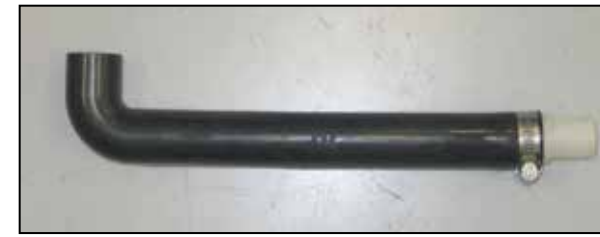
15. On models with air injection, install the 1.0" hose mender into the provided air injection hose (08479) and secure with the provided hose clamp.