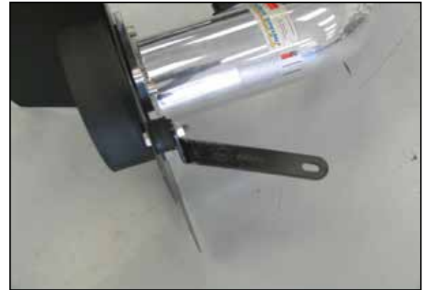
22. Install the rubber mounted stud and "L" bracket onto the heat shield with the provided hardware. Do not tighten completely at this time.