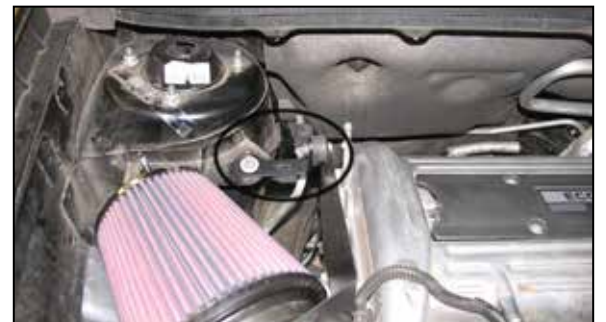
26. Align the heat shield bracket onto the stock airbox mounting stud and secure it with the stock bolt from step #10.