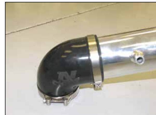
20. Install the silicone hose and hose clamps onto the intake tube as shown.