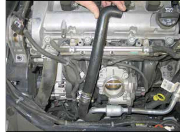
16. On models with air injection, attach the air injection hose assembly to the factory rubber air injection hose and secure with provided hose clamp.