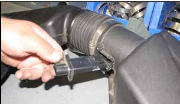
11. Remove mass air sensor from stock intake tube.