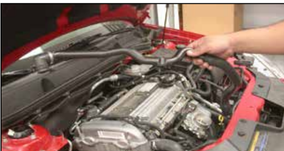
14. On models with air injection, disconnect the air injection pump plastic hard line from the air injection rubber hose.