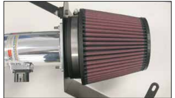
23. Secure the K&N® air filter onto the filter adapter and secure with provided hose clamp. NOTE: Drycharger® filter wrap; part # RU-5147DK is available to purchase separately. To learn more about Drycharger® filter wraps or look up color availability please visit http://www.knfilters.com