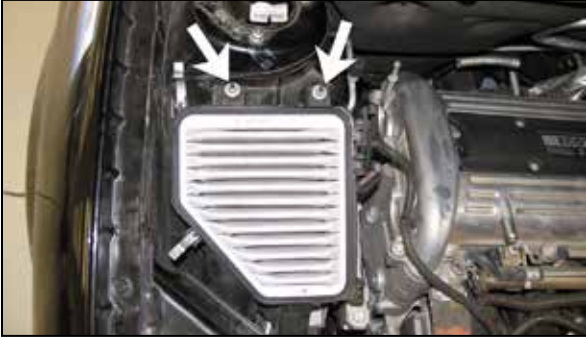
10. Loosen and remove the two airbox retaining nuts then remove the airbox from vehicle. NOTE: K&N Engineering, Inc., recommends that customers do not discard factory air intake.