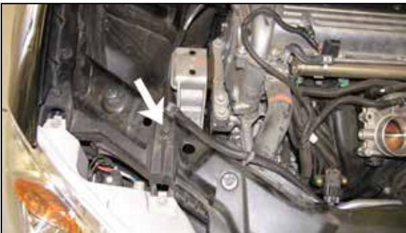
12. Remove the head light mounting bolt and retain as it will be reused.