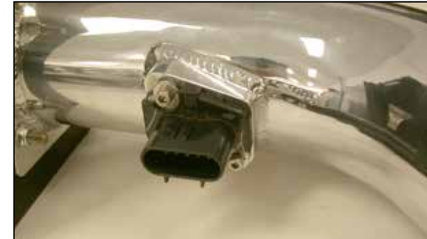
17. Install the mass air sensor onto the K&N® intake tube with provided hardware.