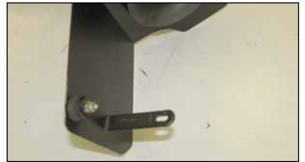
21. Install the rubber mounted stud and small "L" bracket onto the heat shield using supplied hardware. Do not tighten completely at this time.