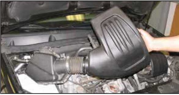
9. Lift firmly upwards and remove airbox from vehicle.