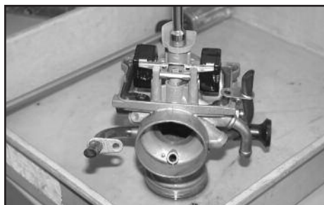
9. Remove the stock main jet from each carburetor.