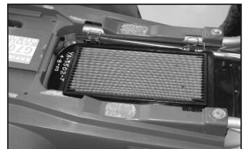
14. Install the X-STREAM™ POWERLID™ on to the air box using the stock retaining clips.

WARNING! The ATV should never be run without the stock primary air filter or a K&N Filtercharger® part number YA-3502