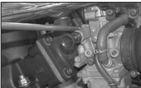
4. Loosen clamps that connect carburetors to the air box and the engine.