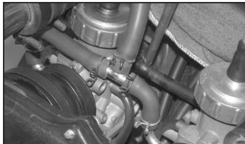
6. Remove all fuel lines from carburetors. It is recommended that you label each fuel line for ease of re-assembly. CAUTION: Be careful, fuel lines may still contain fuel.