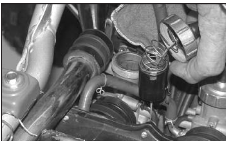
5. Loosen the cap on the slide assembly and remove from the carburetors.