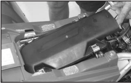
2. Unclip the air box retaining clips on lid and remove it. NOTE: If the stock filter is being replaced with a K&N Filtercharger, do that at this time following the instruction sheet supplied with the K&N Filtercharger.