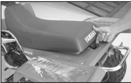
1. Remove the seat.

Congratulations, you have purchased an X-STREAM™ POWERLID™, the latest filtration innovation from K&N, the recognized leaders in the performance filtration industry. The X-STREAM™ POWERLID™ is a pre-filter that is designed to increase the airflow to the engine by eliminating the restrictive intake snorkels while at the same time, extending the service interval of the primary air filter. The X-STREAM™ POWERLID™ MUST BE USED IN CONJUNCTION WITH A PRIMARY AIR FILTER AT ALL TIMES. The X-STREAM™ POWERLID™ comes complete with the necessary carburetor components required to properly jet a stock machine. If the machine has any modifications such as a pipe or porting, the supplied jets may not be correct for this application, see Main Jet/Tuning Recommendations. Due to the limited size of the X-STREAM™ POWERLID™, it will require servicing more often than the primary filter typically does. For extremely rigorous conditions, the X-STREAM™ POWERLID™ is supplied with its own DRYCHARGER™ to extend the service interval for those extra long weekends in the desert. By cleaning, replacing or removing the DRYCHARGER™ and/or the X-STREAM™ POWERLID™, it should no longer be necessary to service the primary air filter in the field where the risk of engine contamination is at its highest. Please follow the separate DRYCHARGER™ instructions for installation onto the X-STREAM™ POWERLID™.