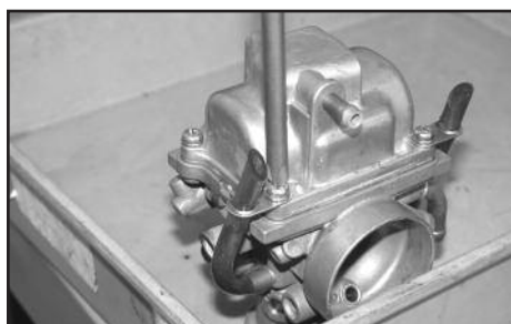
8. Remove the float bowls from each carburetor.